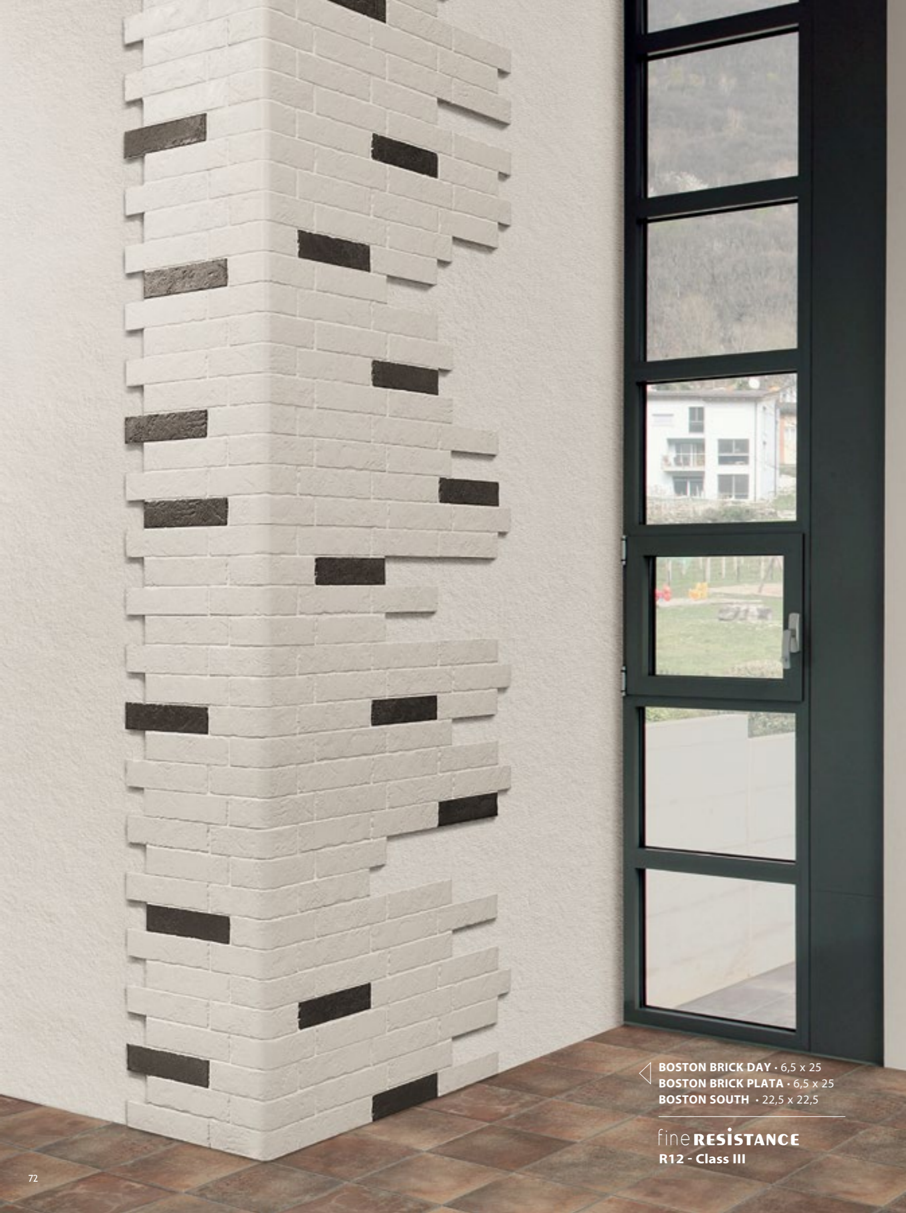
BOSTON BRICK DAY · 6,5 x 25 BOSTON BRICK PLATA · 6,5 x 25 BOSTON SOUTH · 22,5 x 22,5