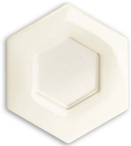
DUAL COTTON HEX. DUAL 11,7 x 13,5 - 4,6" x 5,3"